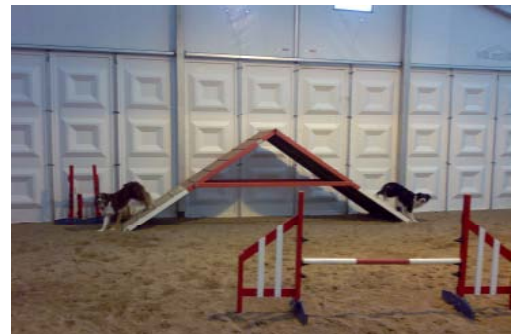
Murphy and Storm demonstrating perfect stops!!

To vote for your favourite please email: newsletter@douglasdogtrainingclub.co.uk