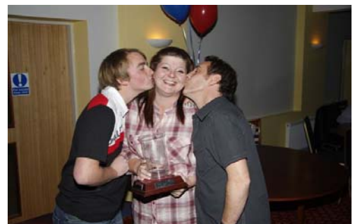
Any excuse boys!!

Well what can I say about this duo, I guess it will have to be stunning, simply stunning! This award is for dog of the year; however, as we all know it takes a partnership to succeed at agility. This partnership has gone from strength to strength and has been an inspiration to us all. The achievements over the past year are just far too many to mention - but there are a couple which are definitely worth mentioning. This dog achieved grade 6 this year and is now well on her way to Grade 7. As if that is not enough - she is also on her way to Crufts representing the Isle of Man in 2011!