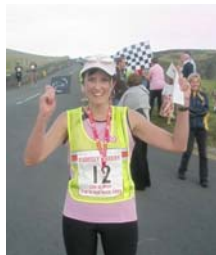
Completing the end to end

Dog training - of course! St John Ambulance member. Walking (parish & End to End long distance). Scuba diving (PADI advanced). Shooting with my old man - rifle, pistol and clay. Nothing living ever!!